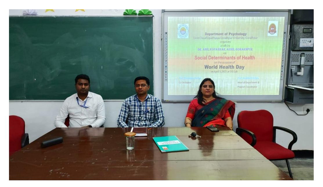
The Speakers with The Convenor of the Program