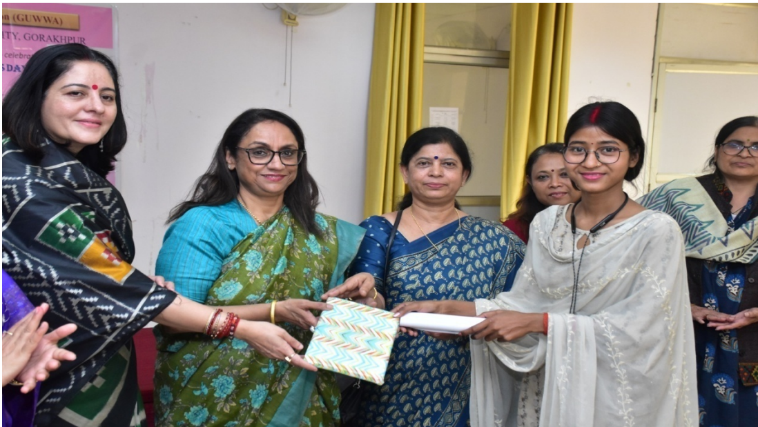
Poster Competition :DigitALL: Innovation and Technology for Gender Equality