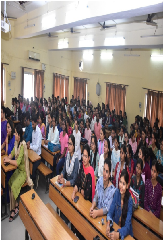
S Participants of the Programme.