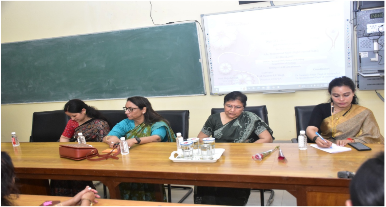
GUWWA President with the Speakers of the Day