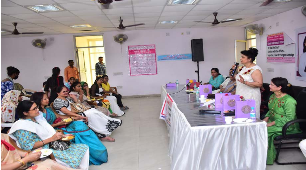
Women's Health Check Up Camp organized by GUWWA on May 28, 2022