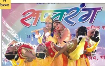
सांस्कृतिक संस्था - सप्तरंग में विद्यार्थियों की इन्द्रधनुषी प्रस्तुति