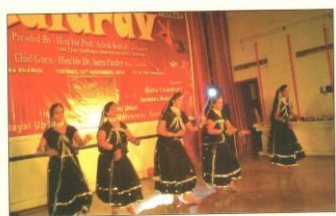
Cultural Evening, Students Union.