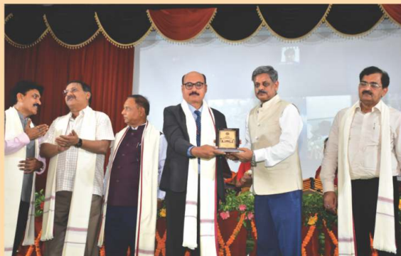
Alumni Meet 2022

Padamshree Vishwanath Prasad Tiwari , Hindi Poet, Editor, Critic and Former President of the Sahitya Akademy & Vyas Samman Awardee