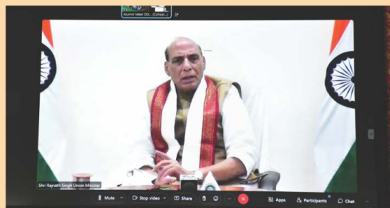
Alumni Meet 2022