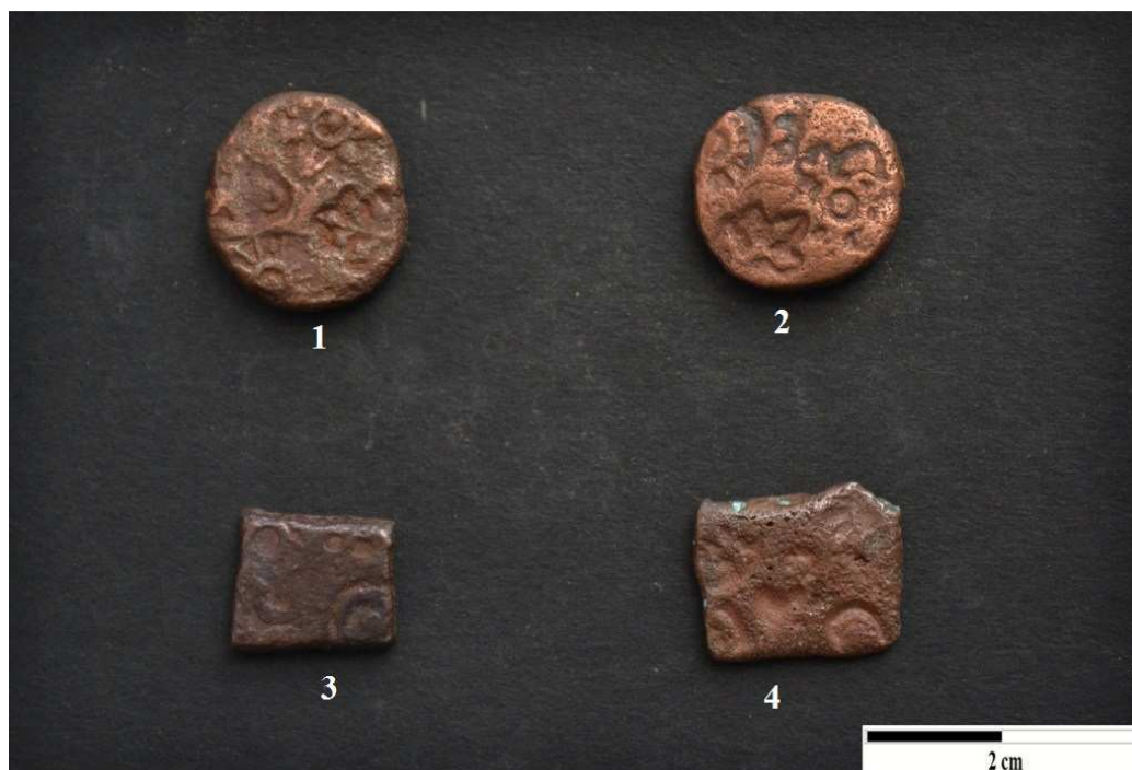
Pl. 6.18 Copper Punched Marked coins (obverse), IshapurTil.