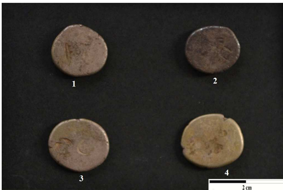
Pl. 6.23 Silver Punched marked coins (reverse), Hastinapur.