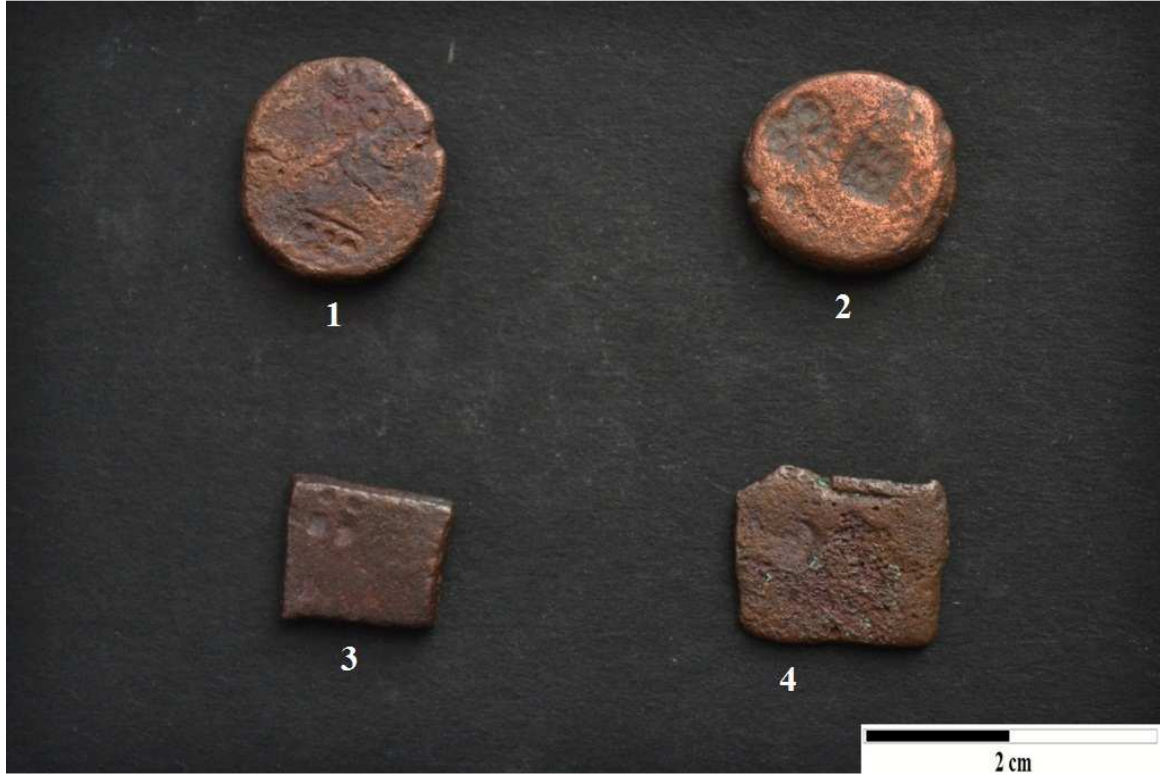
Pl. 6.19 Copper Punched Marked coins (reverse), IshapurTil.