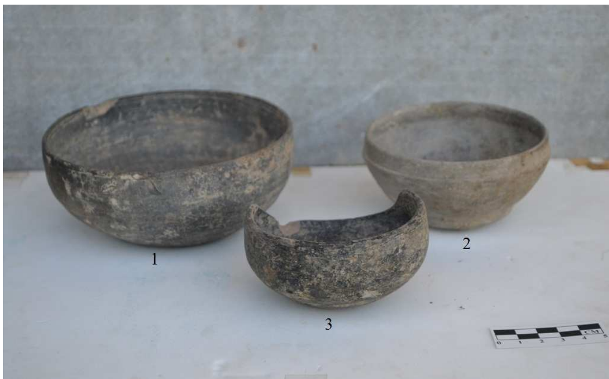
Pl. 6.1 Grey Ware associated with NBPW, Ahichchhatra