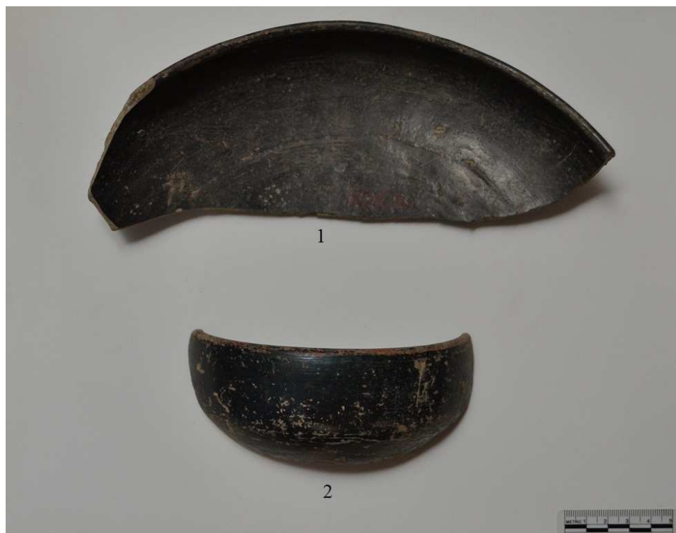
Pl. 6.7 Northern Black Polished ware, Kausambi.