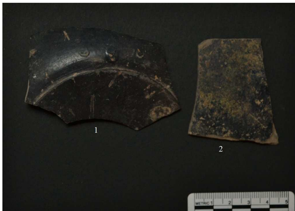
Pl. 6.8 Northern Black Polished ware, Kausambi