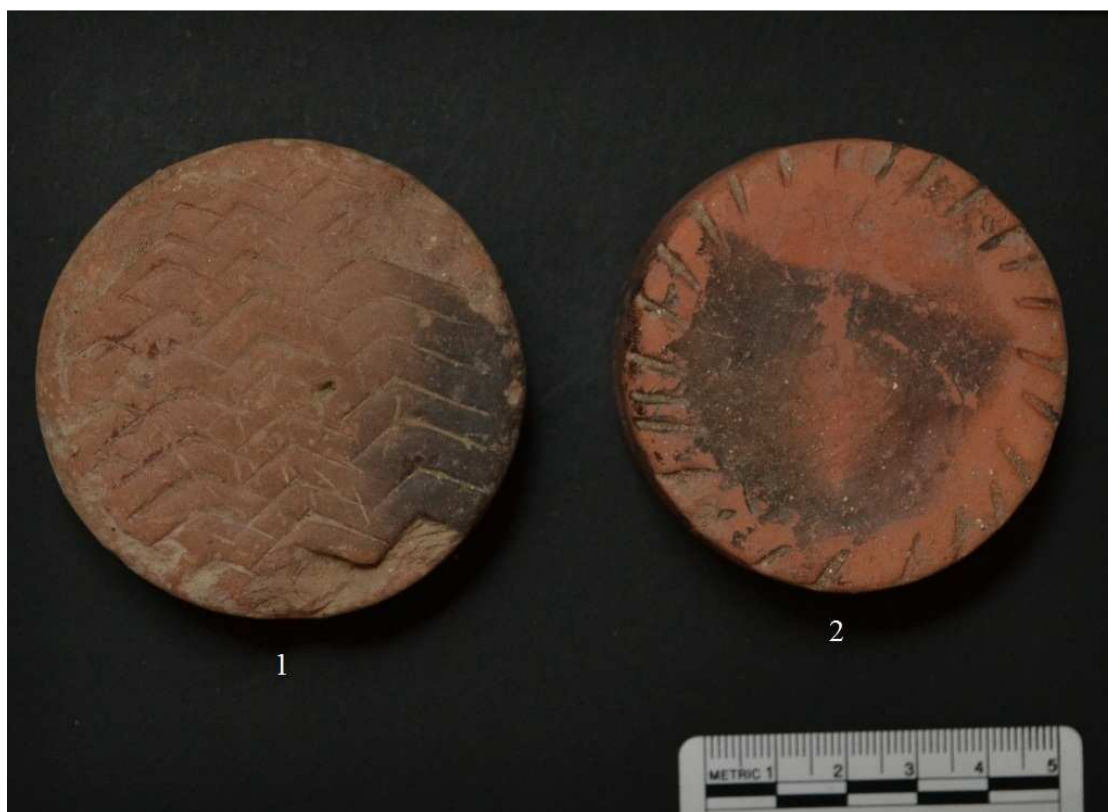
Pl. 6.14 Terracotta disc, Ahichchhatra.