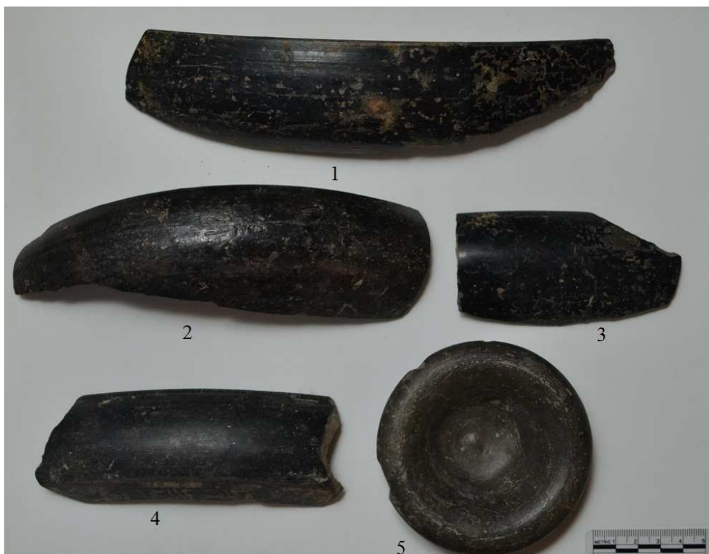
Pl. 6.6 Northern Black Polished ware, Kausambi