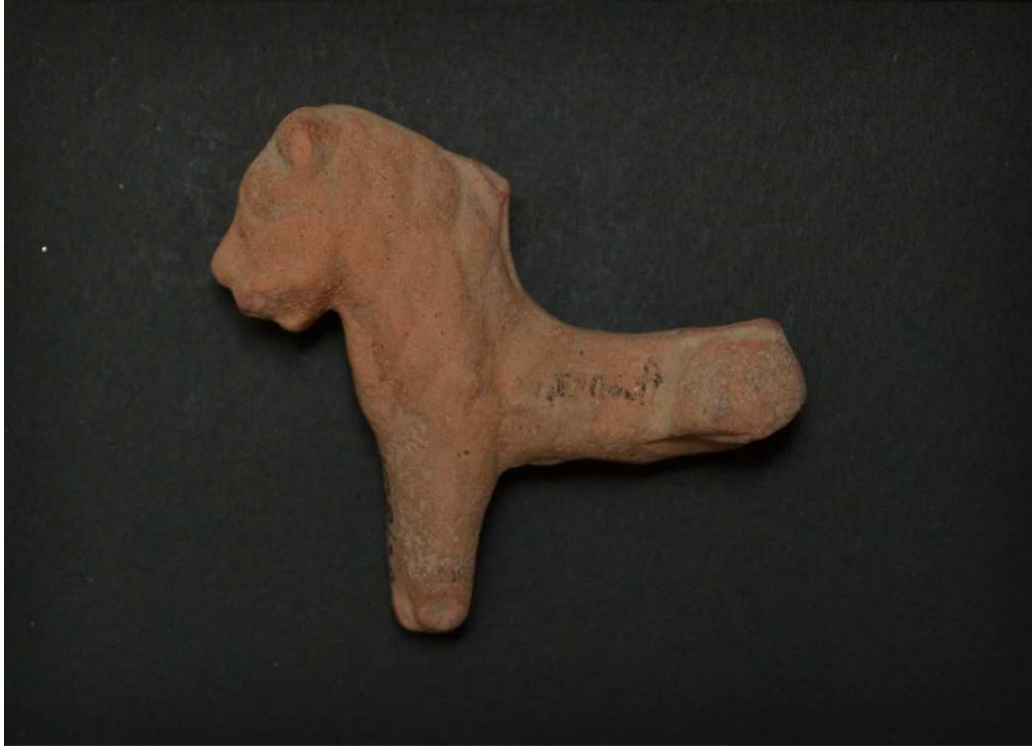
Pl. 6.11 Terracotta animal figurine, Kausambi