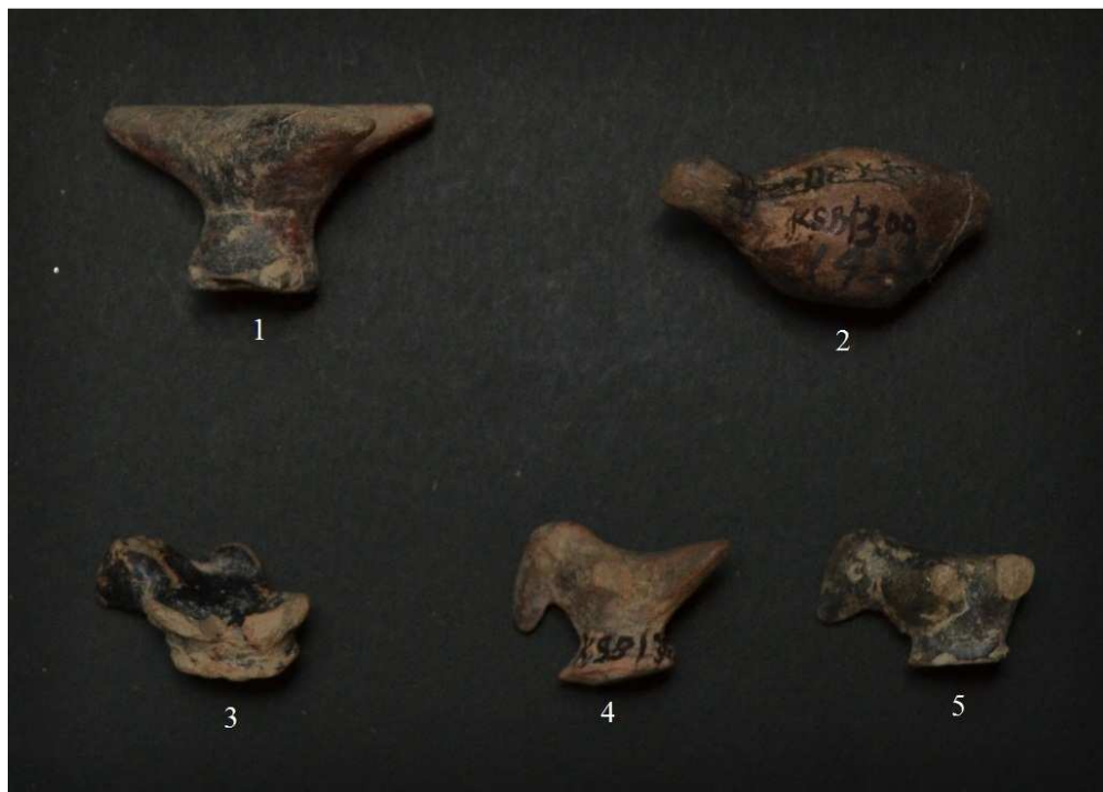
Pl. 6.10 Terracotta bird figurine, Kausambi.