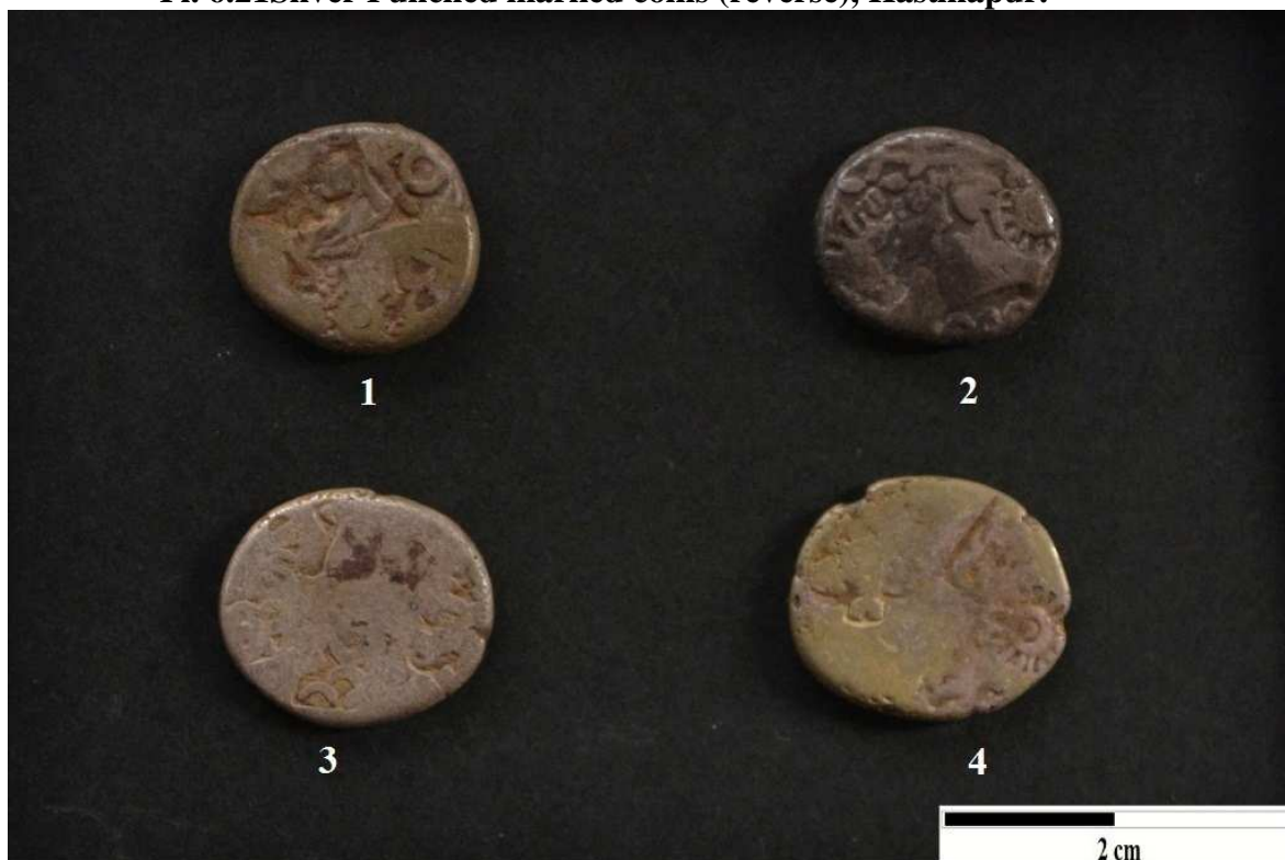
Pl. 6.22 Silver Punched marked coins (obverse), Hastinapur.