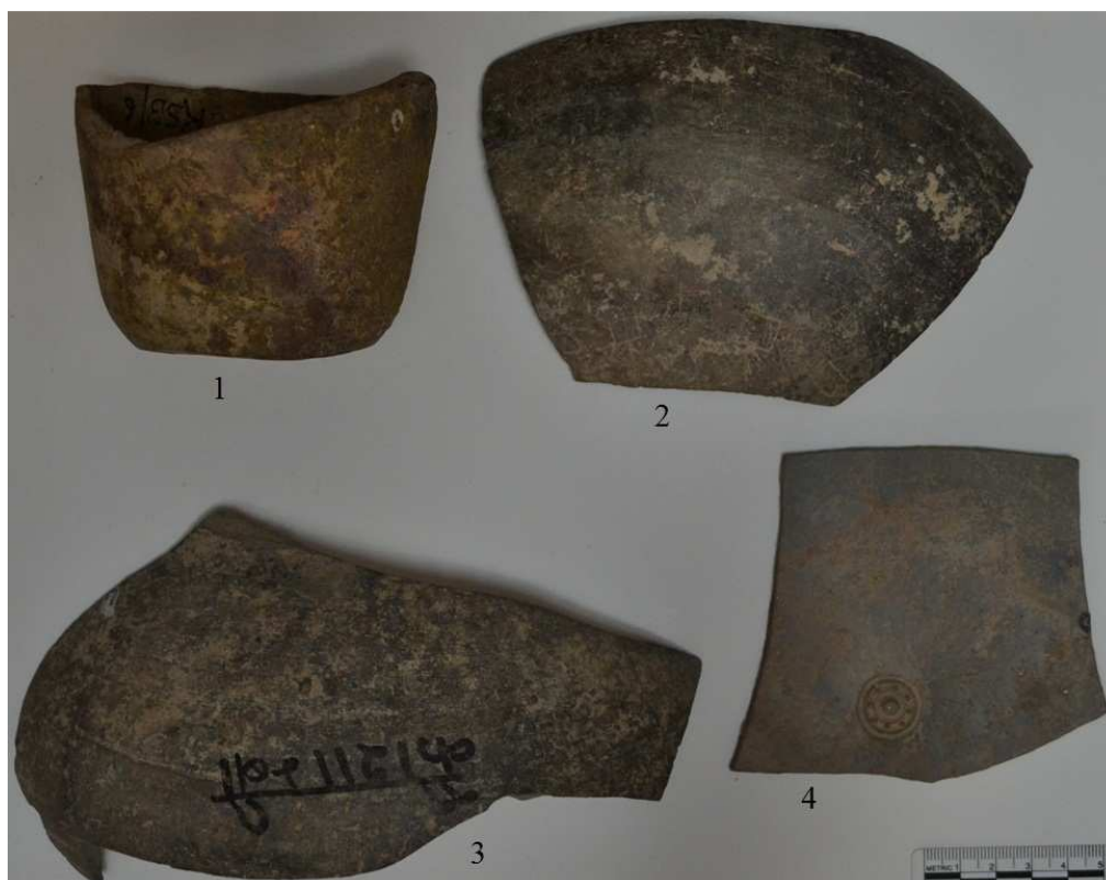
Pl. 6.4 NBPW and associated Grey Ware, 1:Ahichchhatra; 2,3&4:Kausambi.