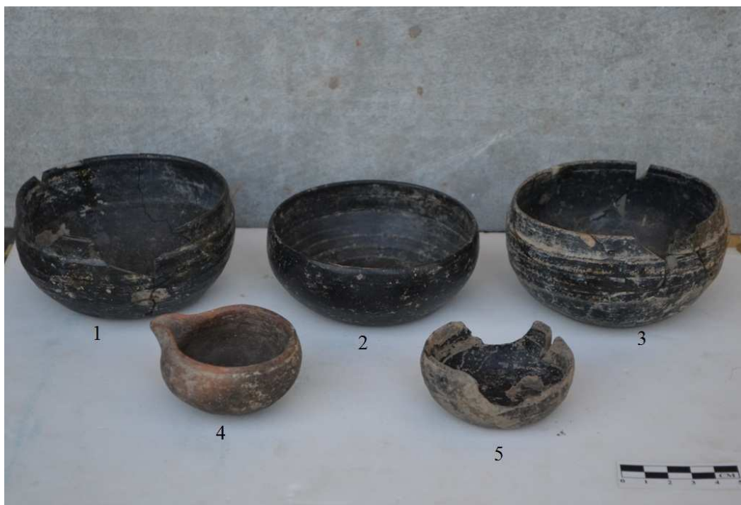
Pl. 6.3 NBPW and associated Grey Ware, 1,2&5:Ahichchhatra; 3&4 Kausambi.