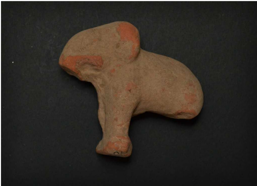
Pl. 6.12 Terracotta animal figurine, Kausambi.