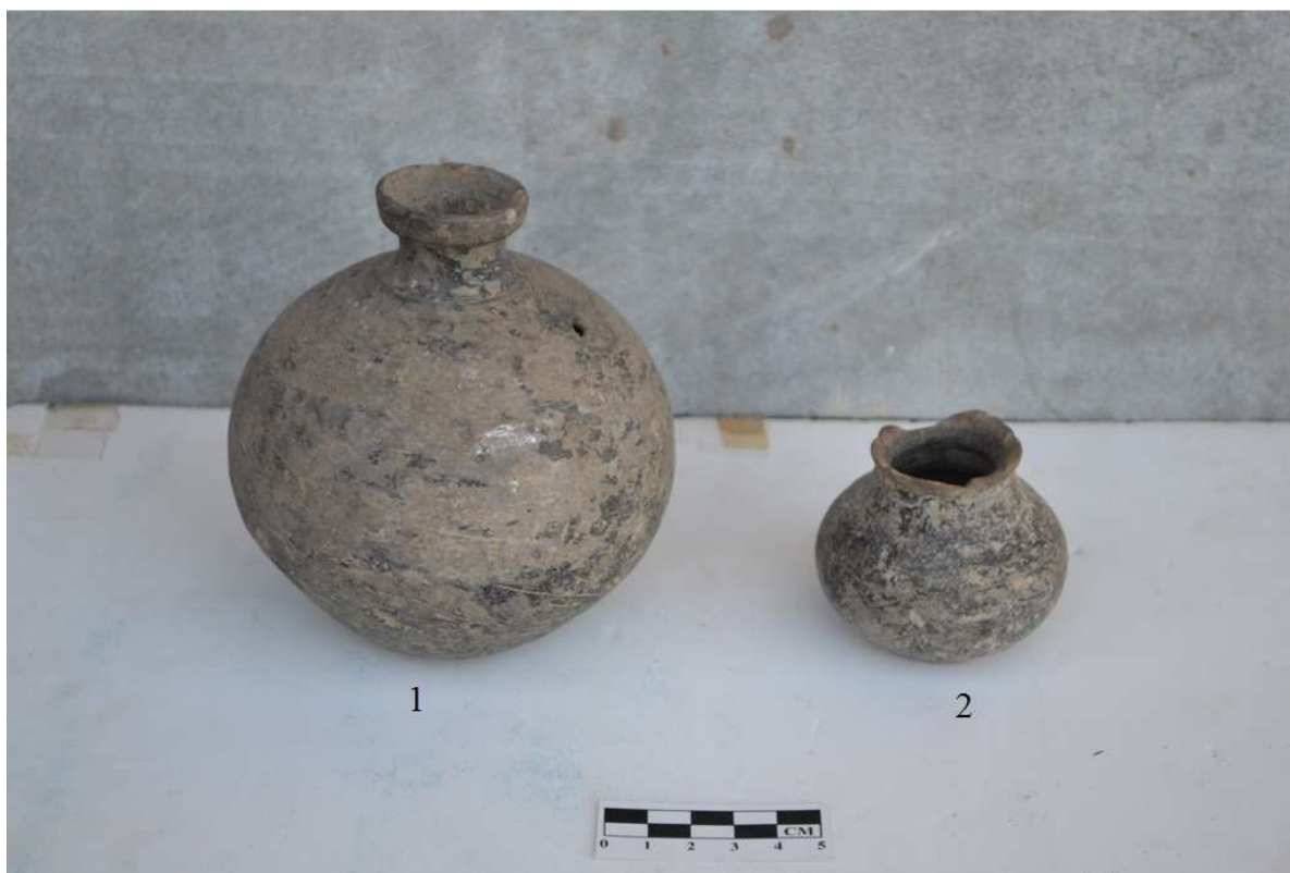
Pl. 6.2 Grey Ware associated with NBPW, Hastinapur