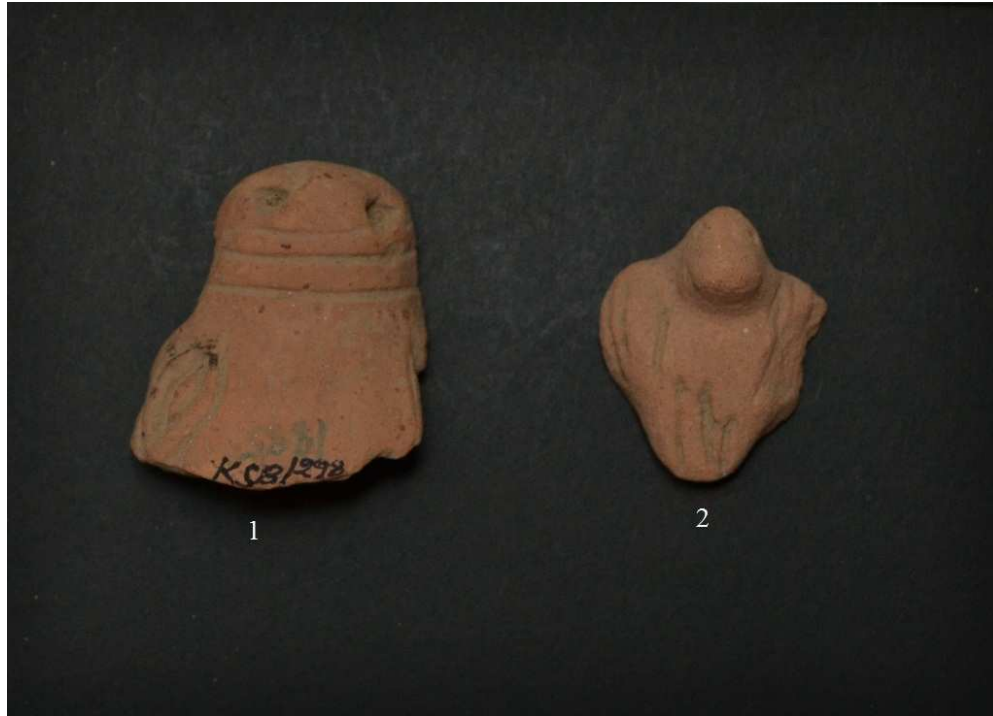
Pl. 6.9 Terracotta bird figurine, Kausambi.