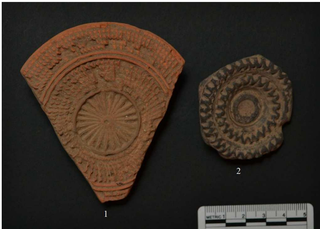
Pl. 6.15 Terracotta textile dies, Ahichchhatra.