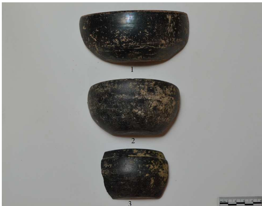
Pl. 6.5 Northern Black Polished ware, Kausambi