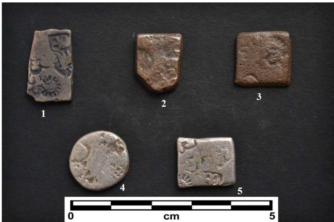
Pl. 6.16 Silver Punched Marked coins (obverse), Ishapur Til