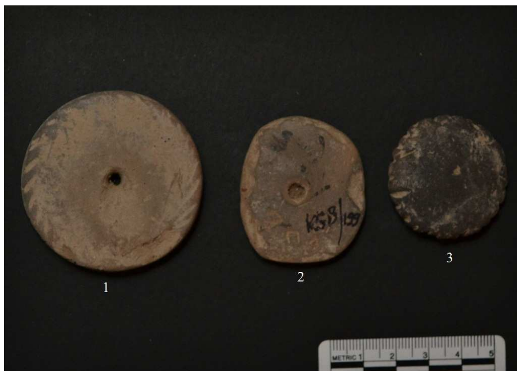
Pl. 6.13 Terracotta wheel, Kausambi.