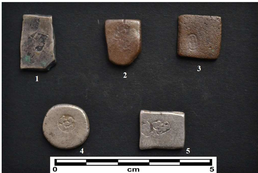
Pl. 6.17 Punched marked coins (reverse), IshapurTil.